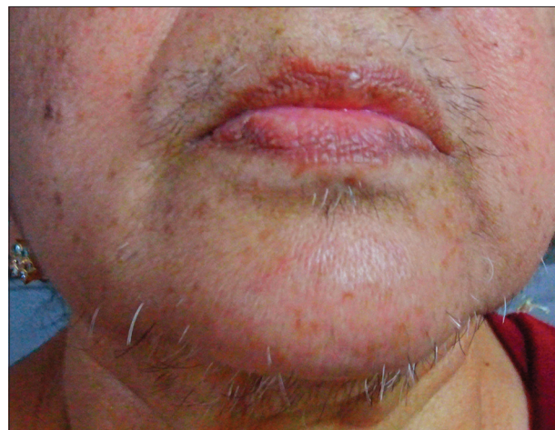
Figure 2: Slight reduction in the hair growth around the chin and lip after stopping bimatoprost eyedrops