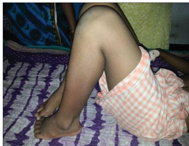
Figure 3: Flexed legs

with i.v. calcium gluconate. 24 h following this episode the laboratory investigations were repeated, which showed serum calcium 9.3 mg/dL, potassium, 3.9 mmol/L, sodium 144 mmol/L and serum albumin 4.2 g/dL [Table 1]. On recovery, the patient was discharged with oral calcium supplementation. After 4 weeks the surgery was planned. Netilmicin 300 mg once daily was given preoperatively for 1 day and continued postoperatively. But after 3 days (4 doses) postoperatively the patient developed the same features of carpopedal spasm with laboratory findings of