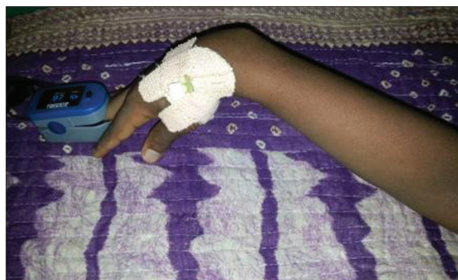
Figure 2: Carpal spasm (right hand)